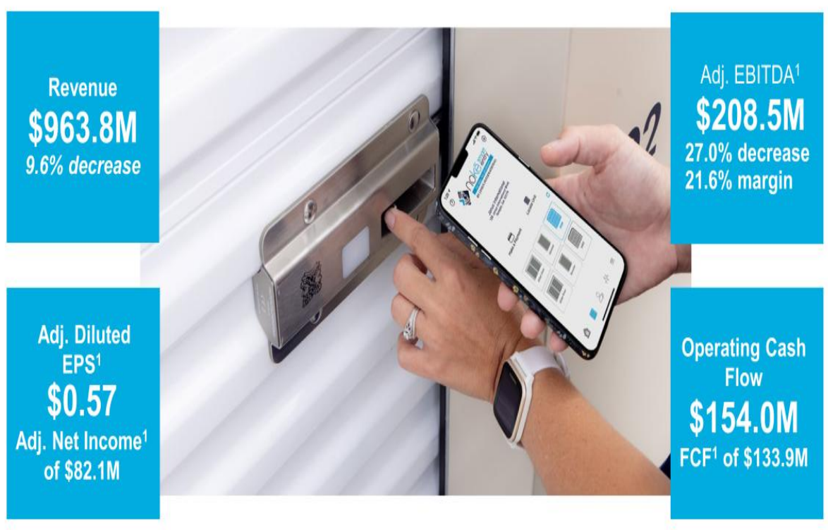
Strong Cash Flow Generation Amid A Challenging Macroeconomic Environment

1. Adjusted EBITDA, Adjusted Net Income, Adjusted Diluted EPS, and free cash flow are not financial measures determined in accordance with GAAP. For a definition of these metrics and a reconciliation to our most directly comparable financial measure calculated and presented in accordance with GAAP, please see the company's latest filings with the SEC as well as the appendix of this presentation.